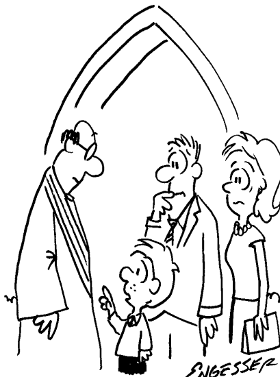
ENGESSE "You're right. Man does not live on bread alone. My mom and dad use credit cards."